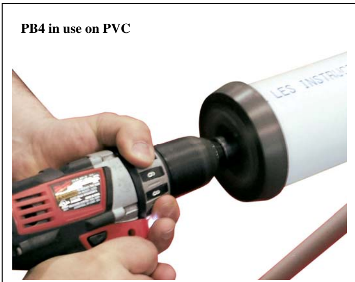
PB4 in use on PVC